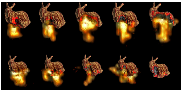
Figure 1: Wooden bunnies, decomposing

There has been an increasing interest within the computer graphics community for simulation and visualization of natural phenomena such as water motion, smoke and fire. While recent fire models [4, 5, 2] are promising, none of them yet model decomposition of the burning solids and solids are rather treated only as a fuel source. Some recent visualization research has focused on tracking the motion of the flame front, yet it assumes the underlying geometry is fixed. We present a new method for modeling and visualization of decomposing objects under combustion. A coarse grid fire simulation is implemented to provide the heat distribution and fuel gas motion required by the model. The heat produced by combustion affects the motion of the air within the computational domain, which in turn affects the shape and motion of the flame. In addition, this heat transport allows us to simulate self-ignition of objects away from the flame itself.