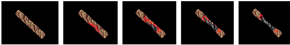
Figure 2: Time sequence of a decomposing solid (fire is not displayed for clarity)